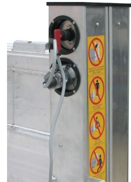
Detachable 2-button remote control and safety key control